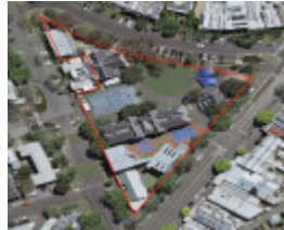
aerial extent of registration