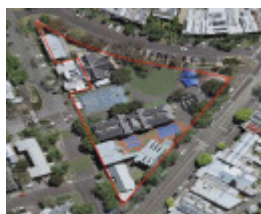
aerial extent of registration