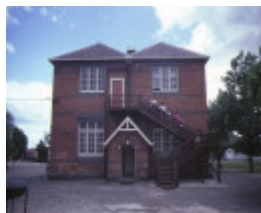
Primary School No. 1181, Bridport Street Albert Park, side entrance, Dec 1984