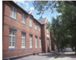
Primary School No. 1181, Bridport Street Albert Park, rear elevation, Dec 1984