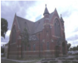
Primary School No. 1181, Bridport Street Albert Park, corner view, Dec 1984