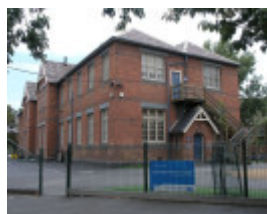
PRIMARY SCHOOL NO. 1181 SOHE 2008