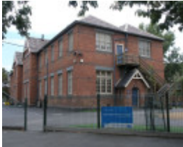
PRIMARY SCHOOL NO. 1181 SOHE 2008