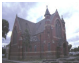
Primary School No. 1181, Bridport Street Albert Park, corner view, Dec 1984