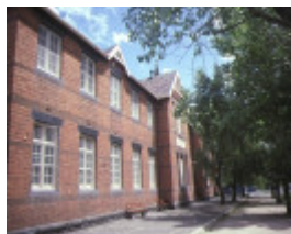
Primary School No. 1181, Bridport Street Albert Park, rear elevation, Dec 1984