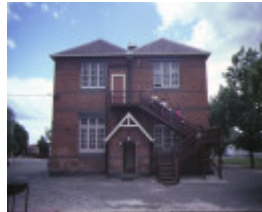
Primary School No. 1181, Bridport Street Albert Park, side entrance, Dec 1984