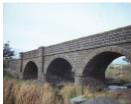
1 rothwell bridge over little river werribee side view jul1984