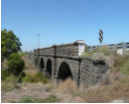
ROTHWELL BRIDGE SOHE 2008