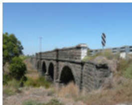
ROTHWELL BRIDGE SOHE 2008