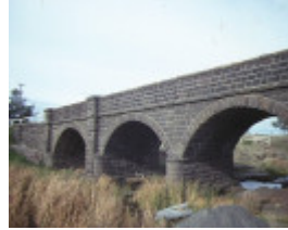
1 rothwell bridge over little river werribee side view jul1984