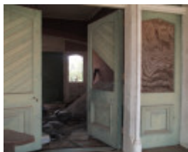
H1590 FORMER RUPANYUP RAILWAY STATION LHA 2015 8.JPG