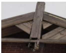
H1590 FORMER RUPANYUP RAILWAY STATION LHA 2015 5.JPG