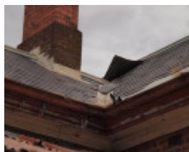
H1590 FORMER RUPANYUP RAILWAY STATION LHA 2015 6.JPG