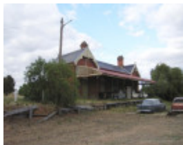
FORMER RUPANYUP RAILWAY STATION SOHE 2008