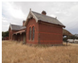
H1590 FORMER RUPANYUP RAILWAY STATION LHA 2015 1.JPG