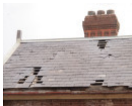
H1590 FORMER RUPANYUP RAILWAY STATION LHA 2015 4.JPG