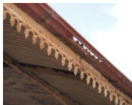
H1590 FORMER RUPANYUP RAILWAY STATION LHA 2015 3.JPG