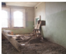
H1590 FORMER RUPANYUP RAILWAY STATION LHA 2015 7.JPG