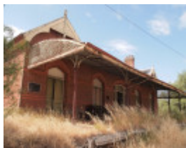
H1590 FORMER RUPANYUP RAILWAY STATION LHA 2015 2.JPG