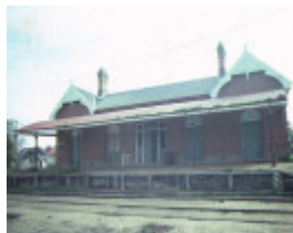
1 rupanyup railway station cromie street rupanyup trackside view jul1984