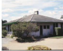
1 stokesay seaford front view