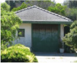
STOKESAY SOHE 2008