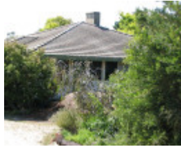
STOKESAY SOHE 2008