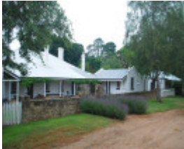
HABBIES HOWE HOMESTEAD SOHE 2008