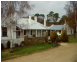
1 habbies howe 1999