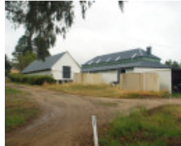
HABBIES HOWE HOMESTEAD SOHE 2008