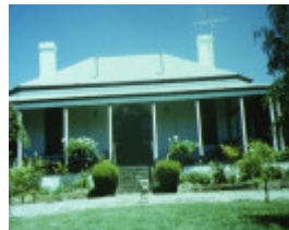
Habbies Howe Homestead Seymour Front View