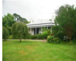
HABBIES HOWE HOMESTEAD SOHE 2008