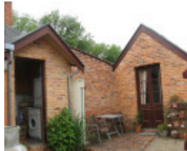
Back entrance and 1862 kitchen