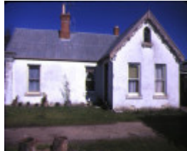
1 39 finch street beechworth front view sep1983