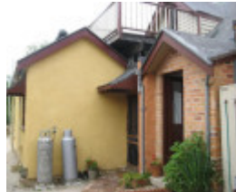
Rear, 1867 kitchen on left