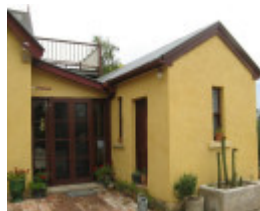
kitchen and bathroom right