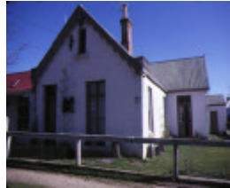
39 finch street beechworth side view sep1983