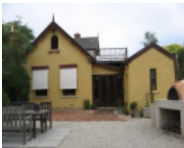
view from north, kitchen on right, infilled breezeway between it and house