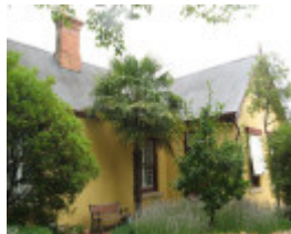
Entrance in corner