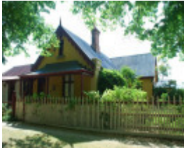
BUILDING SOHE 2008