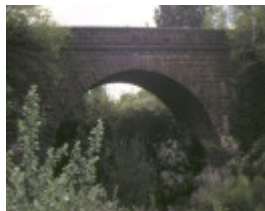
1 bridge over bullarook creek smeaton side view