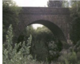
1 bridge over bullarook creek smeaton side view