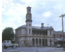
1 beechworth post office ford street beechworth front view dec1990