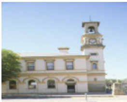
beechworth post office ford street beechworth front elevation