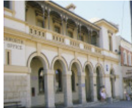
beechworth post office ford street beechworth colonaded verandah