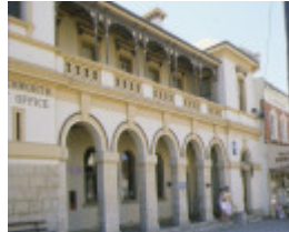
beechworth post office ford street beechworth colonaded verandah