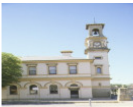
beechworth post office ford street beechworth front elevation