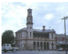
1 beechworth post office ford street beechworth front view dec1990