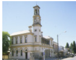
beechworth post office ford street beechworth side view