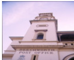
beechworth post office ford street beechworth tower elevation mar1998