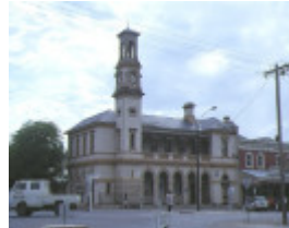
1 beechworth post office ford street beechworth front view dec1990