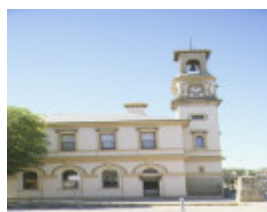
beechworth post office ford street beechworth front elevation