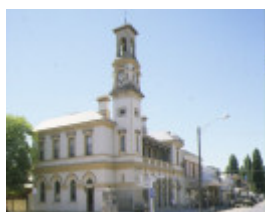
beechworth post office ford street beechworth side view