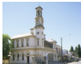
beechworth post office ford street beechworth side view