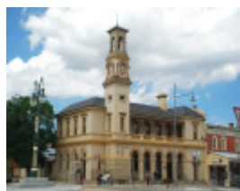
BEECHWORTH POST OFFICE SOHE 2008