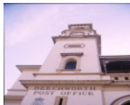
beechworth post office ford street beechworth tower elevation mar1998