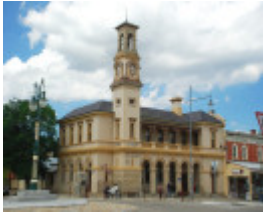
BEECHWORTH POST OFFICE SOHE 2008