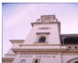
beechworth post office ford street beechworth tower elevation mar1998