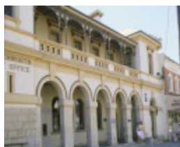
beechworth post office ford street beechworth colonaded verandah