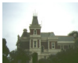
1 coolart lord somers road somers front view jan1994