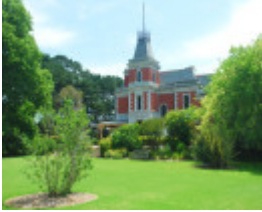
COOLART SOHE 2008