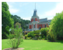
COOLART SOHE 2008