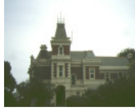
1 coolart lord somers road somers front view jan1994