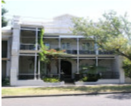
DALKEITH SOHE 2008