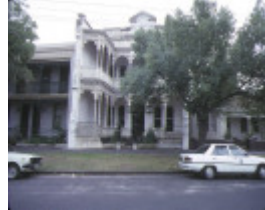
1 dalkeith 314 albert)street south melbourne front view jan1989