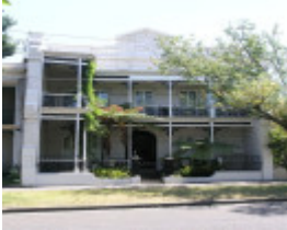
DALKEITH SOHE 2008