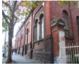
Melbourne Tramway and Omnibus Company Engine House