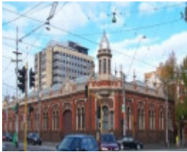
Melbourne Tramway and Omnibus Company Engine House