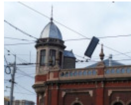
Melbourne Tramway and Omnibus Company Engine House