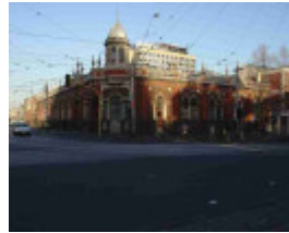
Melbourne Tramway and Omnibus Company Engine House