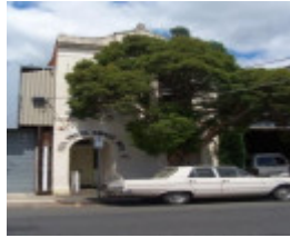
Dairy - Keele Street