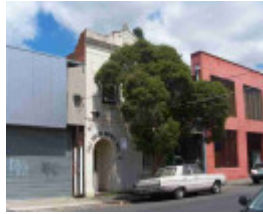
Dairy - Keele Street