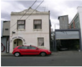
Dairy - Keele Street