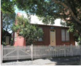
IRON HOUSE SOHE 2008