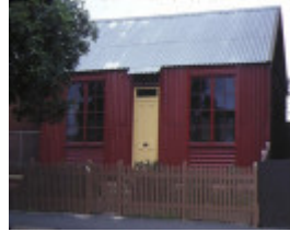
1 iron house coventry street south melb front view