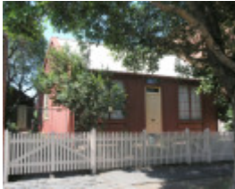
IRON HOUSE SOHE 2008