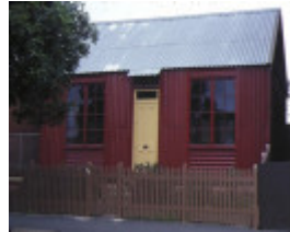
1 iron house coventry street south melb front view