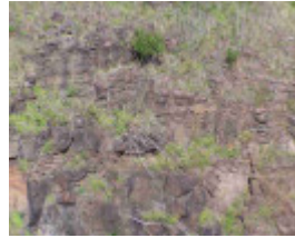
Fitzroy City Council Quarry