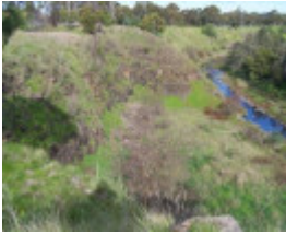
Fitzroy City Council Quarry