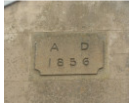
104344 Hamilton Highway St Andrew s Anglican Chapel 458