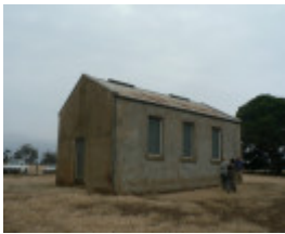
104344 Hamilton Highway St Andrew s Anglican Chapel 457