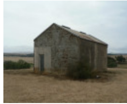
104344 Hamilton Highway St Andrew s Anglican Chapel 459