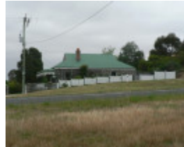
Athelston, 2025 Hamilton Highway, Murgheboluc viewed from north.