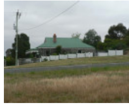
Athelston, 2025 Hamilton Highway, Murgheboluc viewed from north.