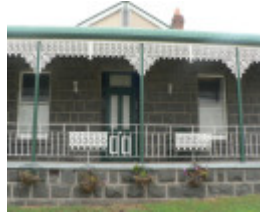
Athelston, 2025 Hamilton Highway, Murgheboluc viewed from east.