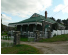
Athelston, 2025 Hamilton Highway, Murgheboluc viewed from north-east.