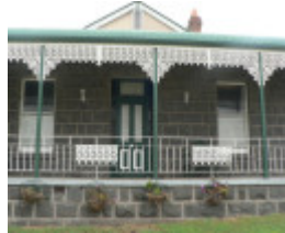
Athelston, 2025 Hamilton Highway, Murgheboluc viewed from east.