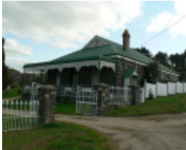
Athelston, 2025 Hamilton Highway, Murgheboluc viewed from north-east.