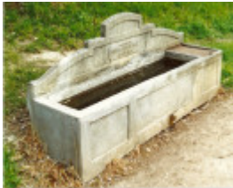
Horse Trough 1522 Main Rd Research Colour 1 - Shire of Eltham Heritage Study 1992