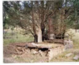
Queenstown Cemetery Colour 2 - Shire of Eltham Heritage Study 1992