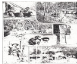
Queenstown Cemetery Mining 2 - Shire of Eltham Heritage Study 1992