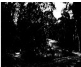
263 - Queenstown Cemetery 07 - Shire of Eltham Heritage Study 1992