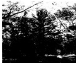
263 - Queenstown Cemetery 03 - Shire of Eltham Heritage Study 1992