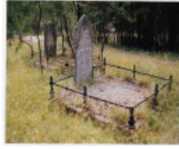
Queenstown Cemetery Colour 1 - Shire of Eltham Heritage Study 1992