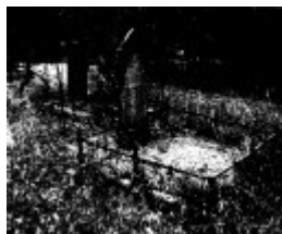
263 - Queenstown Cemetery 09 - Shire of Eltham Heritage Study 1992