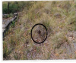
Queenstown Cemetery Colour 4 - Shire of Eltham Heritage Study 1992