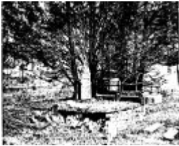
263 - Queenstown Cemetery - Shire of Eltham Heritage Study 1992