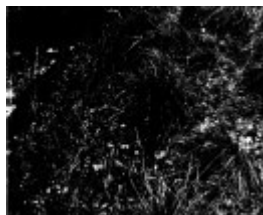
263 - Queenstown Cemetery 08 - Shire of Eltham Heritage Study 1992