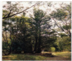
Queenstown Cemetery Colour 8 - Shire of Eltham Heritage Study 1992