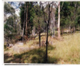
Queenstown Cemetery Colour 5 - Shire of Eltham Heritage Study 1992