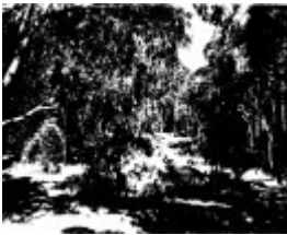
263 - Queenstown Cemetery 04 - Shire of Eltham Heritage Study 1992