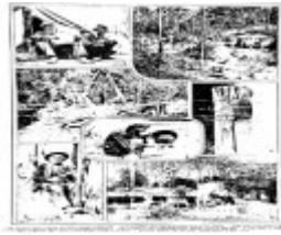
263 - Queenstown Cemetery 02 - Relics of the old mining days in the Queenstown district, The Leader, date unknown - includes a photograph of the cemetery. Note the well-kept nature of this cemetery then and the young cypress trees (ELHPC No.161) - Shire o