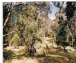
Queenstown Cemetery Colour 7 - Shire of Eltham Heritage Study 1992