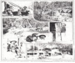
Queenstown Cemetery Mining 1 - Shire of Eltham Heritage Study 1992