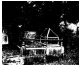
263 - Queenstown Cemetery 06 - Shire of Eltham Heritage Study 1992