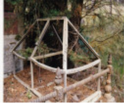
Queenstown Cemetery Colour 3 - Shire of Eltham Heritage Study 1992