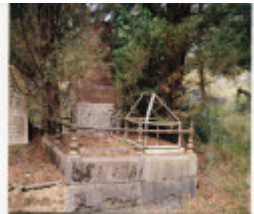
Queenstown Cemetery Colour 6 - Shire of Eltham Heritage Study 1992