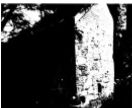
268 - Sweeneys Cottage Eltham 07 - Shire of Eltham Heritage Study 1992