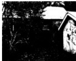
268 - Sweeneys Cottage Eltham 06 - Shire of Eltham Heritage Study 1992