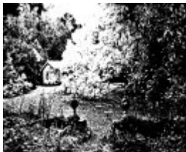
268 - Sweeneys Cottage Eltham 18 - Shire of Eltham Heritage Study 1992