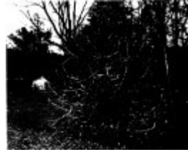
268 - Sweeneys Cottage Eltham 14 - Shire of Eltham Heritage Study 1992