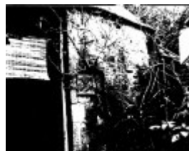
268 - Sweeneys Cottage Eltham 08 - Shire of Eltham Heritage Study 1992