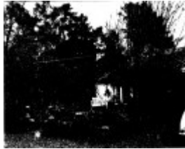
268 - Sweeneys Cottage Eltham 11 - Shire of Eltham Heritage Study 1992