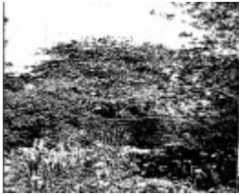
268 - Sweeneys Cottage Eltham 16 - 100 year old pear tree - Shire of Eltham Heritage Study 1992