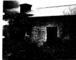
268 - Sweeneys Cottage Eltham 05 - 1949? photograph of a stone cottage stated to have been part of Sweeney's homestead - Shire of Eltham Heritage Study 1992