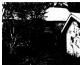
268 - Sweeneys Cottage Eltham 06 - Shire of Eltham Heritage Study 1992