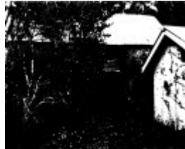
268 - Sweeneys Cottage Eltham 06 - Shire of Eltham Heritage Study 1992