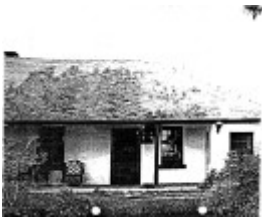
268 - Sweeneys Cottage Eltham - Shire of Eltham Heritage Study 1992