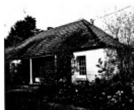
268 - Sweeneys Cottage Eltham 02 - Shire of Eltham Heritage Study 1992