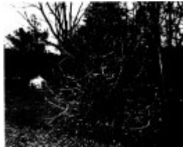
268 - Sweeneys Cottage Eltham 14 - Shire of Eltham Heritage Study 1992