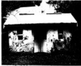
268 - Sweeneys Cottage Eltham 12 - Shire of Eltham Heritage Study 1992