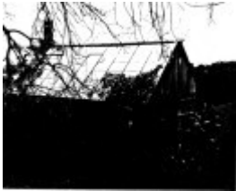
268 - Sweeneys Cottage Eltham 13 - Shire of Eltham Heritage Study 1992