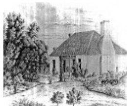
268 - Sweeneys Cottage Eltham 03 - Drawing of Sweeney's Cottage - Origins unknown - Shire of Eltham Heritage Study 1992