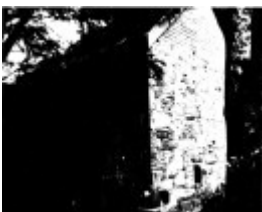
268 - Sweeneys Cottage Eltham 07 - Shire of Eltham Heritage Study 1992