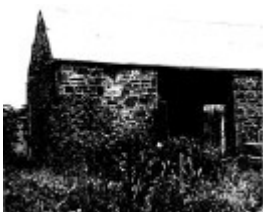
268 - Sweeneys Cottage Eltham 04 - 1949? photograph of the barn - Shire of Eltham Heritage Study 1992