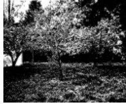
268 - Sweeneys Cottage Eltham 15 - Apple Orchard Trees - Shire of Eltham Heritage Study 1992