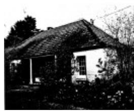
268 - Sweeneys Cottage Eltham 02 - Shire of Eltham Heritage Study 1992