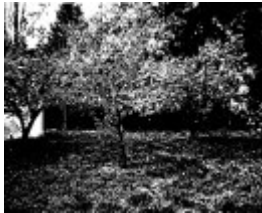
268 - Sweeneys Cottage Eltham 15 - Apple Orchard Trees - Shire of Eltham Heritage Study 1992