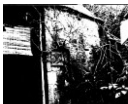
268 - Sweeneys Cottage Eltham 08 - Shire of Eltham Heritage Study 1992