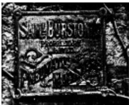
268 - Sweeneys Cottage Eltham 19 - Shire of Eltham Heritage Study 1992