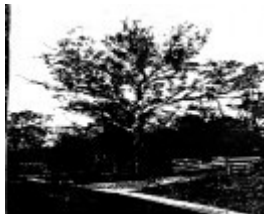
268 - Sweeneys Cottage Eltham 17 - 100 year old apple tree - Shire of Eltham Heritage Study 1992