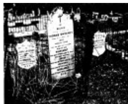
268 - Sweeneys Cottage Eltham 09 - Shire of Eltham Heritage Study 1992