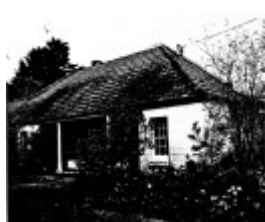
268 - Sweeneys Cottage Eltham 02 - Shire of Eltham Heritage Study 1992