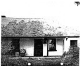
268 - Sweeneys Cottage Eltham - Shire of Eltham Heritage Study 1992