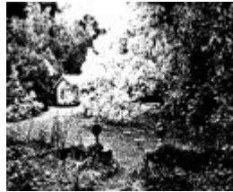
268 - Sweeneys Cottage Eltham 18 - Shire of Eltham Heritage Study 1992