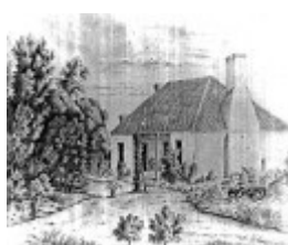
268 - Sweeneys Cottage Eltham 03 - Drawing of Sweeney's Cottage - Origins unknown - Shire of Eltham Heritage Study 1992