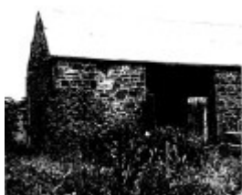
268 - Sweeneys Cottage Eltham 04 - 1949? photograph of the barn - Shire of Eltham Heritage Study 1992