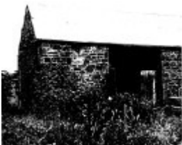
268 - Sweeneys Cottage Eltham 04 - 1949? photograph of the barn - Shire of Eltham Heritage Study 1992