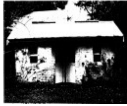
268 - Sweeneys Cottage Eltham 12 - Shire of Eltham Heritage Study 1992