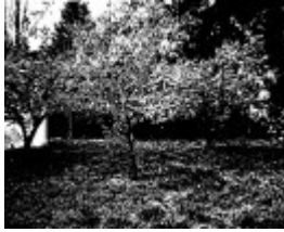
268 - Sweeneys Cottage Eltham 15 - Apple Orchard Trees - Shire of Eltham Heritage Study 1992