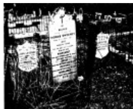
268 - Sweeneys Cottage Eltham 09 - Shire of Eltham Heritage Study 1992