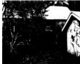
268 - Sweeneys Cottage Eltham 06 - Shire of Eltham Heritage Study 1992