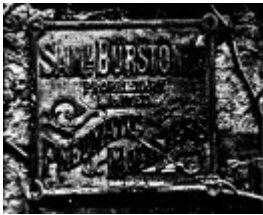
268 - Sweeneys Cottage Eltham 19 - Shire of Eltham Heritage Study 1992