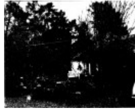
268 - Sweeneys Cottage Eltham 11 - Shire of Eltham Heritage Study 1992