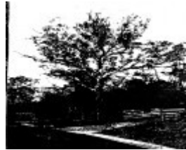
268 - Sweeneys Cottage Eltham 17 - 100 year old apple tree - Shire of Eltham Heritage Study 1992