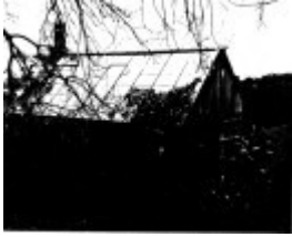
268 - Sweeneys Cottage Eltham 13 - Shire of Eltham Heritage Study 1992