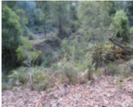
Kelly Camp site H2123 IMG 0804