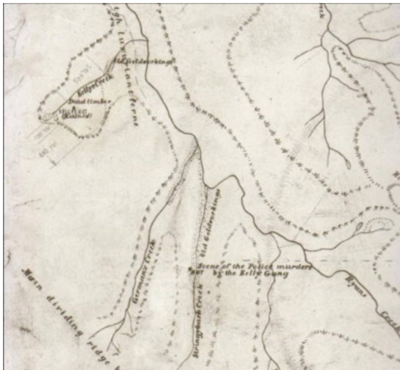
H2123 1884 Surveyors Plan