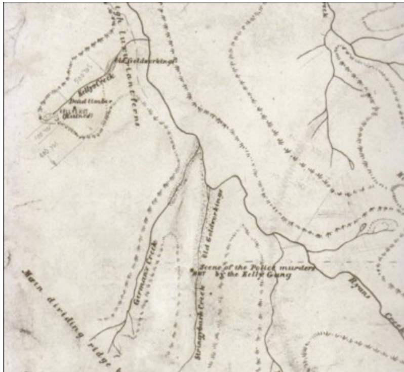
H2123 1884 Surveyors Plan