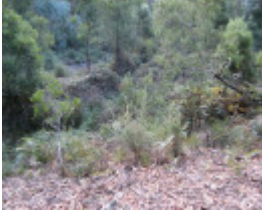
Kelly Camp site H2123 IMG 0804