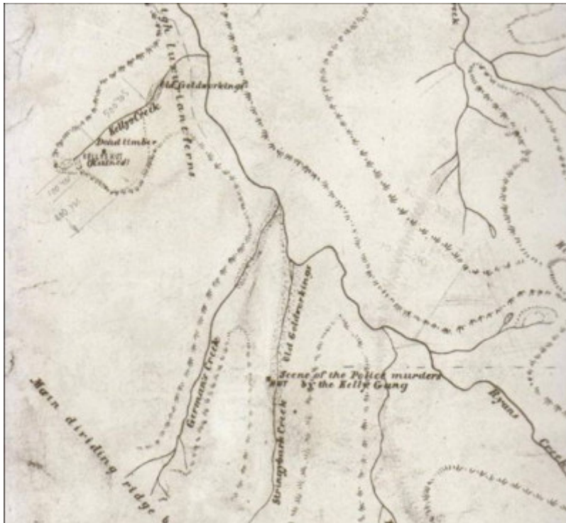
H2123 1884 Surveyors Plan