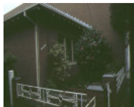
108 116 gladstone street south melbourne iron fence