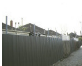
108 116 gladstone street south melbourne rear lane view