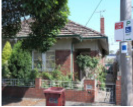
RESIDENCE SOHE 2008