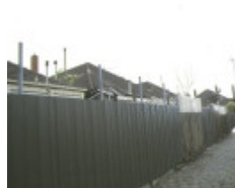
108 116 gladstone street south melbourne rear lane view