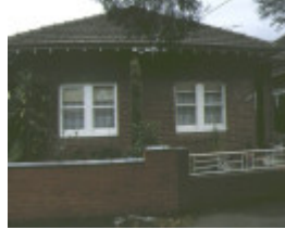
108 116 gladstone street south melbourne frotn view