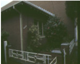
108 116 gladstone street south melbourne iron fence