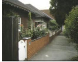
1 108 116 gladstone street south melbourne streetscape