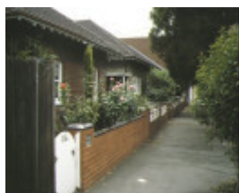
1 108 116 gladstone street south melbourne streetscape