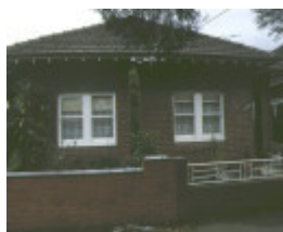
108 116 gladstone street south melbourne frotn view