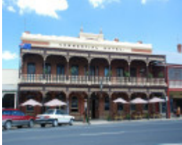
TANSWELLS COMMERCIAL HOTEL SOHE 2008