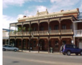
1 tanswells commercial hotel ford street beechworth