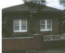
108 116 gladstone street south melbourne front view