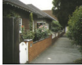
1 108 116 gladstone street south melbourne streetscape