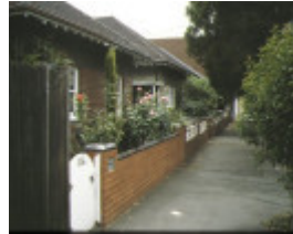
1 108 116 gladstone street south melbourne streetscape