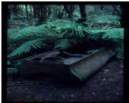
ADA NO.2 MILL