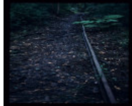
ADA NO.2 MILL