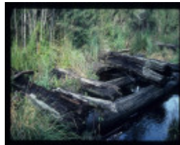
ADA NO.2 MILL