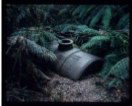
ADA NO.2 MILL