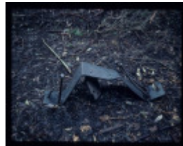
ADA NO.2 MILL