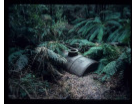
ADA NO.2 MILL