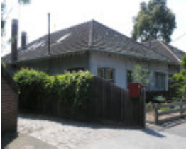
RESIDENCE SOHE 2008