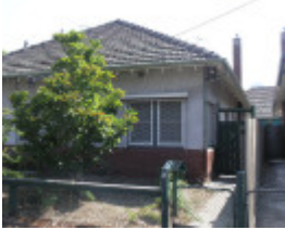
RESIDENCE SOHE 2008