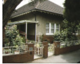
1 83 89 montague street south melbourne front gates & entrance