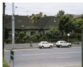
1 83 89 montague street south melbourne front view of row