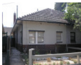
RESIDENCE SOHE 2008