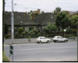
1 83 89 montague street south melbourne front view of row