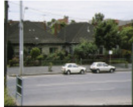
1 83 89 montague street south melbourne front view of row