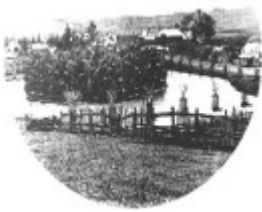
1859 - Brimbank City Council Post-contact Cultural Heritage Study 1998