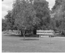
Site 130 - Lagoon reserve, Keilor.jpg