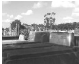
Site 038 - Cemetery.jpg