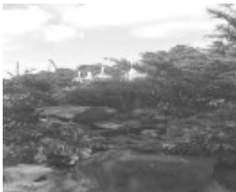
Site 038 - Cemetery (2).jpg