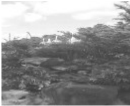
Site 038 - Cemetary (2).jpg