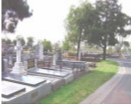
1935a - Brimbank City Council Post-contact Cultural Heritage Study 1998