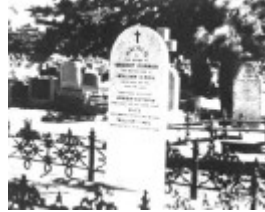
1935b - Brimbank City Council Post-contact Cultural Heritage Study 1998