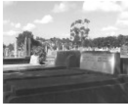
Site 038 - Cemetary.jpg