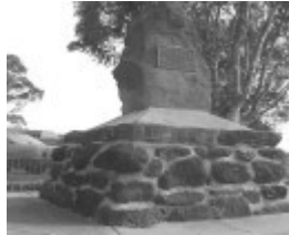
Site 010 - Hume & Hovell Cairn.jpg