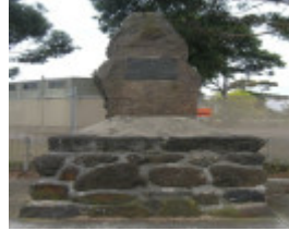
HO34 Hume Hovell Cairn.JPG