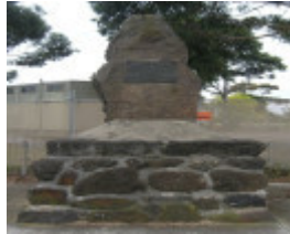
HO34 Hume Hovell Cairn.JPG