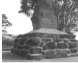
Site 010 - Hume & Hovell Cairn.jpg