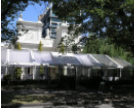
RATHGAEL - THE WILLOWS SOHE 2008