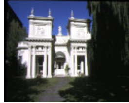
1 rathgael former estella now the willow 462 stkilda rd melb external front view