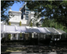
RATHGAEL - THE WILLOWS SOHE 2008