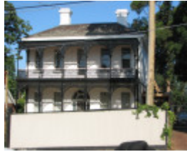
BARWON SOHE 2008