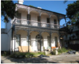
BARWON SOHE 2008