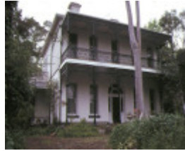
1 barwon cromwell road south yarra front view