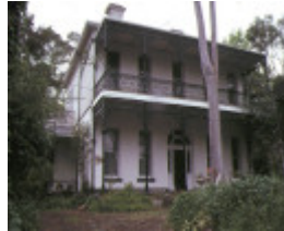
1 barwon cromwell road south yarra front view