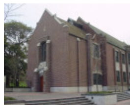
h00019 melbourne grammar school st kilda road melbourne wadhurst hall she project 2004