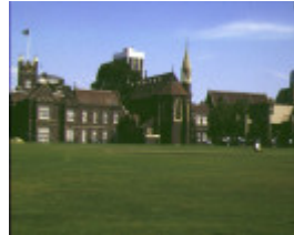
h00019 melbourne grammar school st kilda road side external