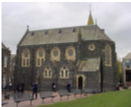
h00019 melbourne grammar school st kilda road melbourne chapel south she project 2004