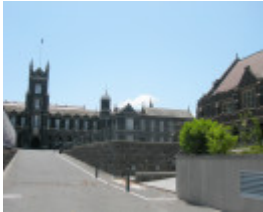
MELBOURNE GRAMMAR SCHOOL SOHE 2008