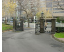
h00019 melbourne grammar school st kilda road melbourne barrett gates she project 2004