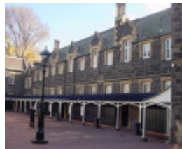
h00019 melbourne grammar school st kilda road melbourne quadrangle north south she project 2004