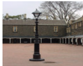
h00019 melbourne grammar school st kilda road melbourne quad lamp she project 2004