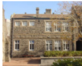
h00019 melbourne grammar school st kilda road melbourne cuming wing east she project 2004