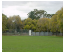
h00019 melbourne grammar school st kilda road melbourne domain road east trees she project 2004