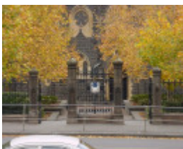
h00019 melbourne grammar school st kilda road melbourne ross gates she project 2004