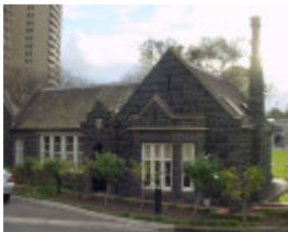
h00019 melbourne grammar school st kilda road melbourne lodge south elevation she project 2004