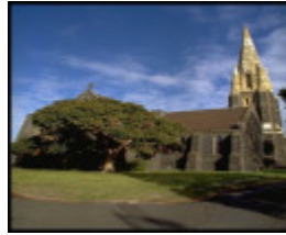
h00635 christ church toorak