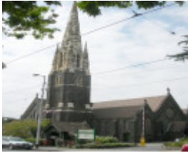
CHRIST CHURCH SOHE 2008