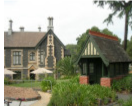
CHRIST CHURCH SOHE 2008