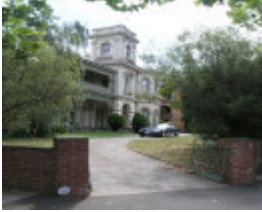
HALCYON SOHE 2008