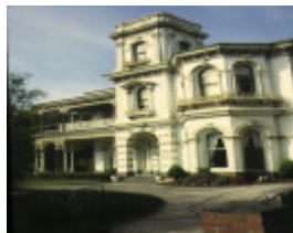
1 halcyon acland street st kilda front view dec1994