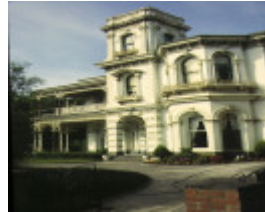
1 halcyon acland street st kilda front view dec1994