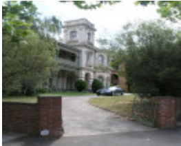
HALCYON SOHE 2008