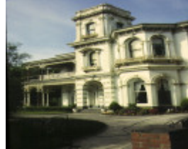
1 halcyon acland street st kilda front view dec1994