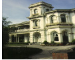
1 halcyon acland street st kilda front view dec1994