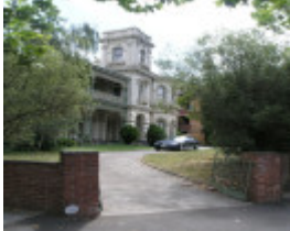
HALCYON SOHE 2008