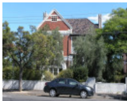
FORMER PRIORY LADIES SCHOOL SOHE 2008