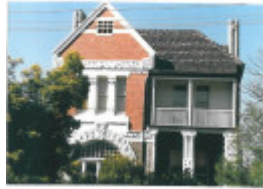
H0726 H0726 frontview