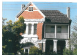
H0726 H0726 frontview