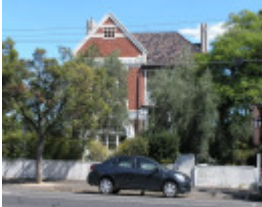
FORMER PRIORY LADIES SCHOOL SOHE 2008