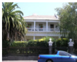
WILGAH SOHE 2008