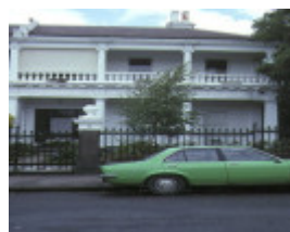
1 residence 8 burnett street st kilda front elevation mar1989