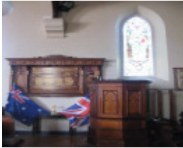
Pulpit and honour board