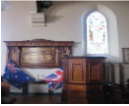
Pulpit and honour board