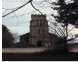
Christ Church Ford Street Beechworth Front View