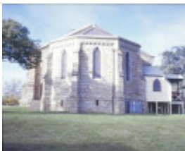
christ church ford street beechworth sanctuary she project 2003