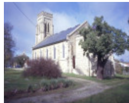
christ church ford street beechworth rear exterior she project 2003