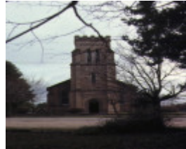
Christ Church Ford Street Beechworth Front View