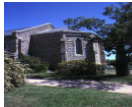
Christ Church Ford Street Beechworth Rear View