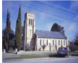
1 christ church ford street beechworth exterior she project 2003