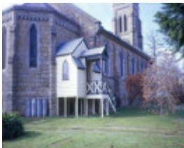
christ church ford street beechworth north wall she project 2003