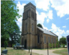
CHRIST CHURCH SOHE 2008