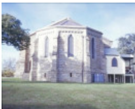
christ church ford street beechworth sanctuary she project 2003