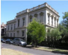
FLEURS SOHE 2008