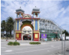
LUNA PARK SOHE 2008