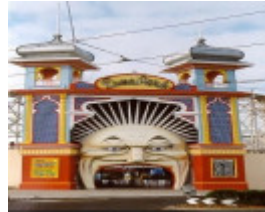
1 luna park h938 entrance april 2000