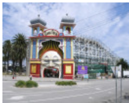
LUNA PARK SOHE 2008