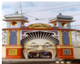
1 luna park h938 entrance april 2000