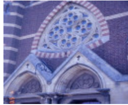
h00864 st georges uniting church chapel street st kilda detail external she project 2003