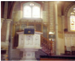
h00864 st george uniting church chapel st st kilda pulpit she project 2003