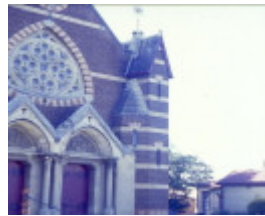
h00864 st georges uniting church chapel street st kilda south side turret she project 2003