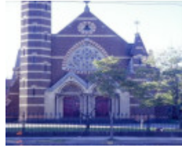
h00864 1 st georges uniting church chapel street st kilda front view she project 2003