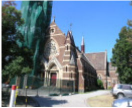
ST GEORGES UNITING CHURCH SOHE 2008