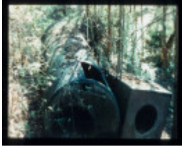
DEPTFORD PROPRIETARY MINE