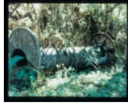
DEPTFORD PROPRIETARY MINE