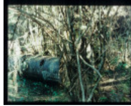
DEPTFORD PROPRIETARY MINE