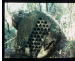
DEPTFORD PROPRIETARY MINE