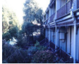
eden terrace dalgety street st kilda view front gardens she project 2003