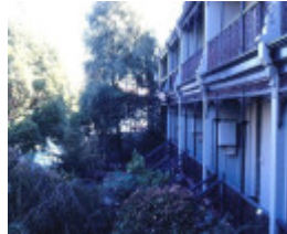
eden terrace dalgety street st kilda view front gardens she project 2003