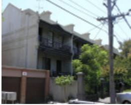
EDEN TERRACE SOHE 2008