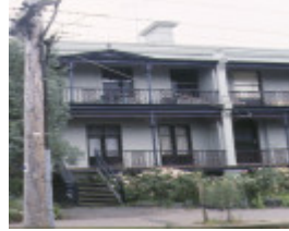
1 eden terrace dalgety street st kilda front view