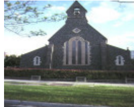
1 st mary's church dandenong road st kilda front view of church