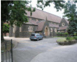
ST MARYS CHURCH SOHE 2008