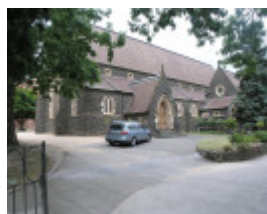
ST MARYS CHURCH SOHE 2008