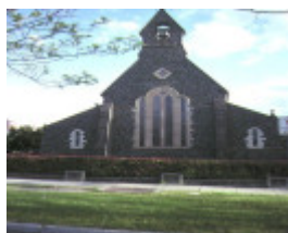
1 st mary's church dandenong road st kilda front view of church