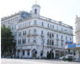
GEORGE HOTEL SOHE 2008