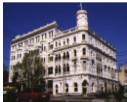
H0706 George Hotel general view 2009