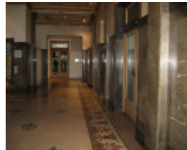
H0706 George Hotel St Kilda 1925 wing ground floor from entrance 2009