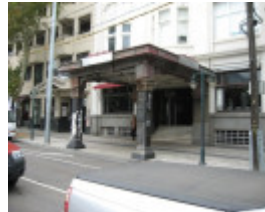
H0706 George Hotel St Kilda 1925 Fitzroy Street entrance to hotel 2009