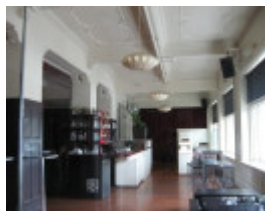
H0706 George Hotel St Kilda 1930 front addition to 1880 building 2009