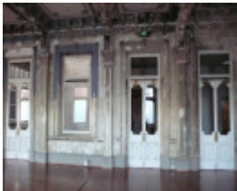
H0706 George Hotel St Kilda Detail of ballroom 2009