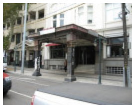
H0706 George Hotel St Kilda 1925 Fitzroy Street entrance to hotel 2009