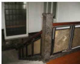
H0706 George Hotel St Kilda 1925 wing stair detail at first floor 2009