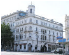
GEORGE HOTEL SOHE 2008