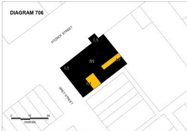
H0706 george hotel revised plan (May 2009)