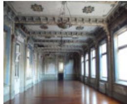
H0706 George Hotel St Kilda ballroom 2009