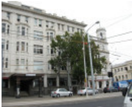
H0706 George Hotel St Kilda Fitzroy Street facade 2009