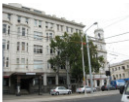
H0706 George Hotel St Kilda Fitzroy Street facade 2009