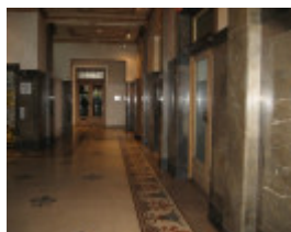
H0706 George Hotel St Kilda 1925 wing ground floor from entrance 2009