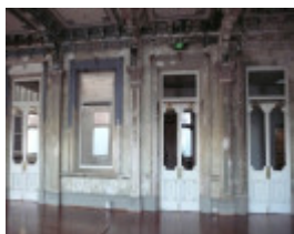
H0706 George Hotel St Kilda Detail of ballroom 2009