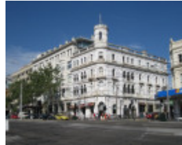
H0706 George Hotel St Kilda general view 2009