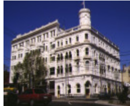
H0706 George Hotel general