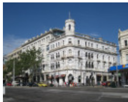
H0706 George Hotel St Kilda general view 2009