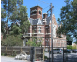
PRIMARY SCHOOL NO.2460 SOHE 2008