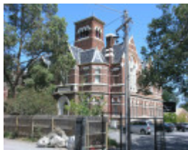
PRIMARY SCHOOL NO.2460 SOHE 2008