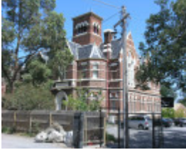
PRIMARY SCHOOL NO.2460 SOHE 2008