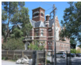
PRIMARY SCHOOL NO.2460 SOHE 2008