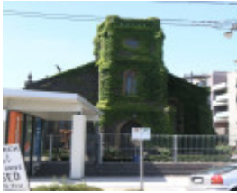
FORMER WESLEYAN METHODIST CHURCH SOHE 2008