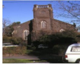
1 former wesleyan methodist church fitzroy street st kilda front view of church