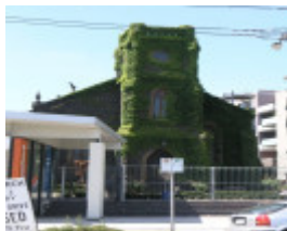
FORMER WESLEYAN METHODIST CHURCH SOHE 2008