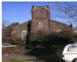
1 former wesleyan methodist church fitzroy street st kilda front view of church