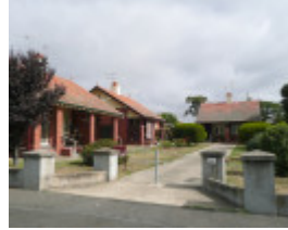
ALEXANDER MILLER MEMORIAL HOMES SOHE 2008