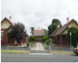
ALEXANDER MILLER MEMORIAL HOMES SOHE 2008