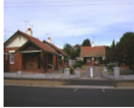
1 alexander miller memorial homes 22 park street geelong complex view apr1997