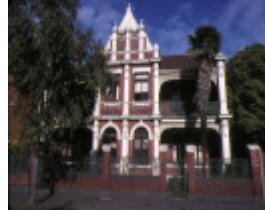
1 residences 77 79 grey street st kilda front view sep1989