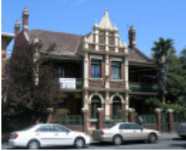
RESIDENCES SOHE 2008